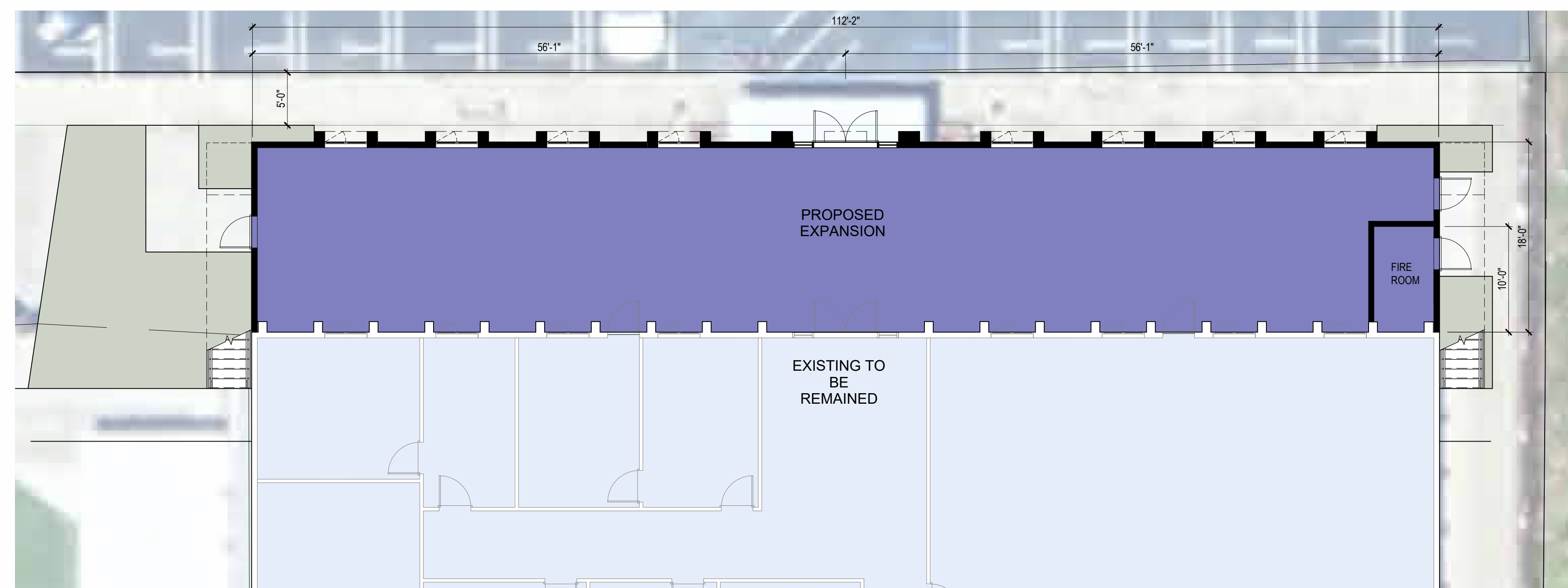
LEVEL 1 EXPANSION FLOOR PLAN 1/8" = 1'-0" 1