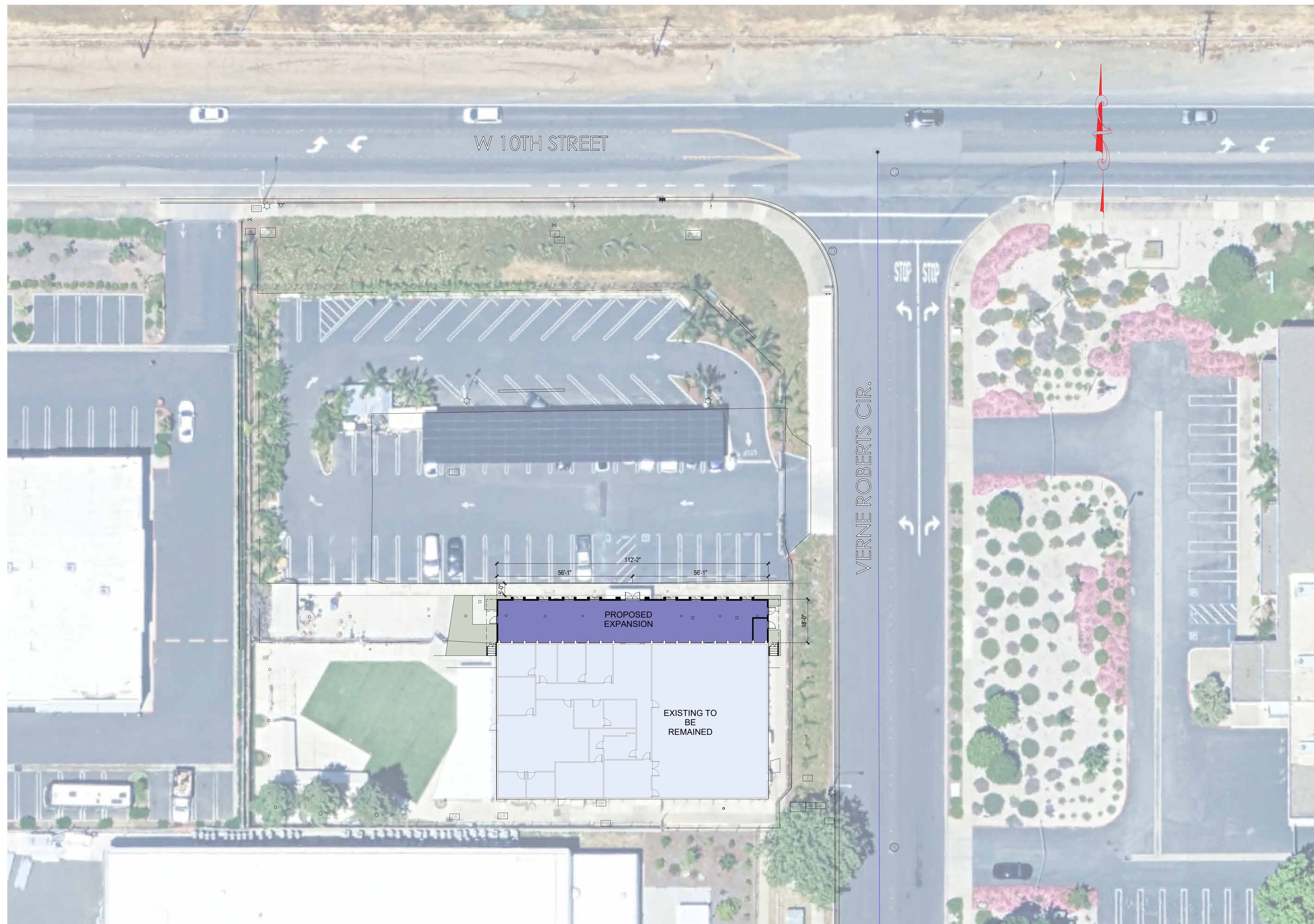
SITE PLAN | 1" = 20'-0" | 1